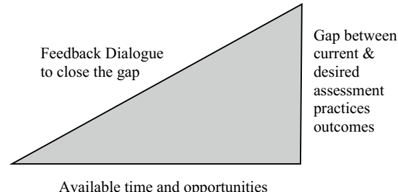
Available time and opportunities to close identified gap